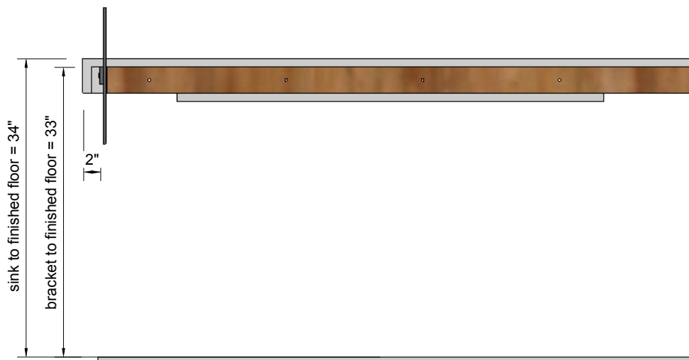
Back view showing placement of T-bracket